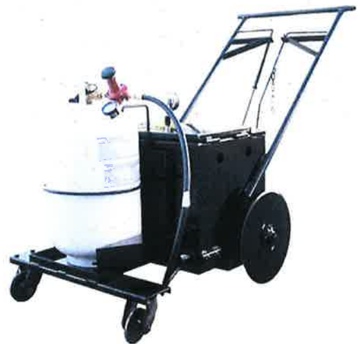
12 gal Mastic Applicator (MD12)